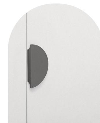
Puzzle D46 19 colori / colours