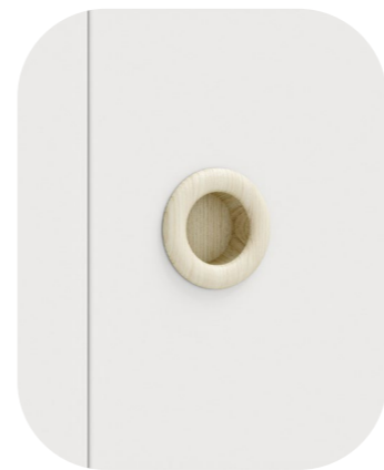
Atollo 1 colore / colour