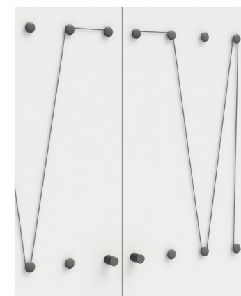
Spider 19 colori / colours