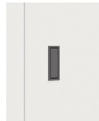
Pull 6 colori / colours