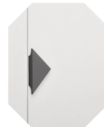
Puzzle D48 19 colori / colours