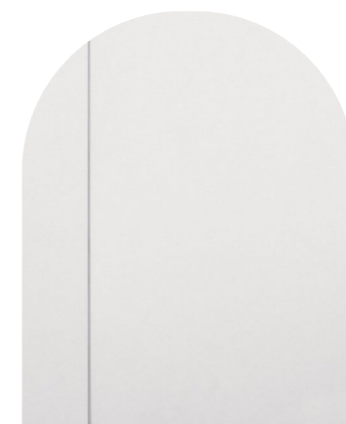
Push-pull / Push-to-open