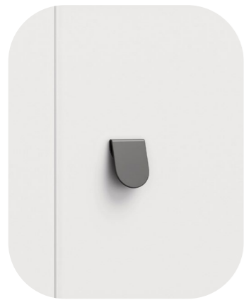
Tab 19 colori / colours