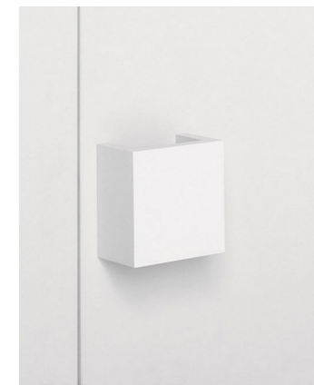
Duo 1 colore / colour