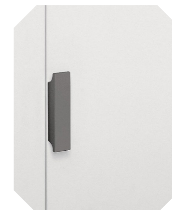
Puzzle D40 19 colori / colours