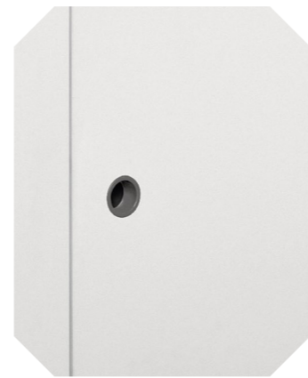
In 19 colori / colours