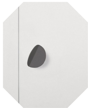
Fefe - Fefe L 19 color / colours