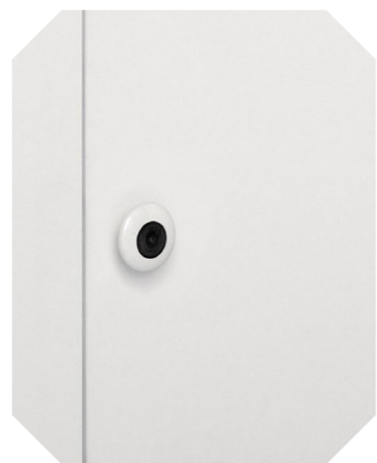
Poddy Ø 4,5 - 7,3 6 colori / colours