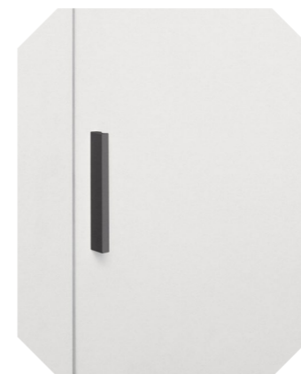
Stick – Stick L – Stick XL 7 colori / colours