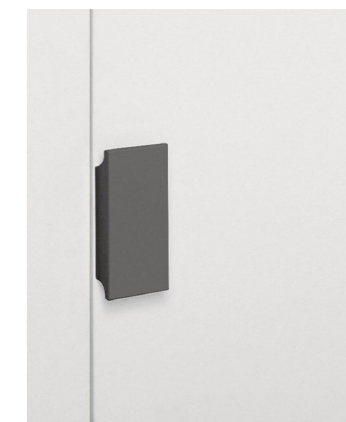
Puzzle D42 19 colori / colours