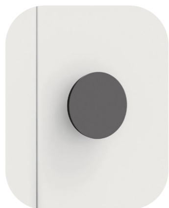
Dot 7 colori / colours