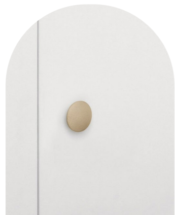
Woody Ø 4,2 - 5,8 - 7,4 - 12 21 colori / colours