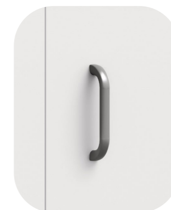
Arko – Arko L 19 colori / colours