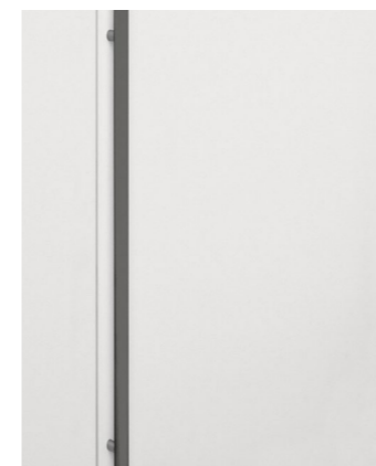
Ben 19 colori / colours