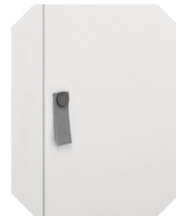
Strip 19 colori / colours