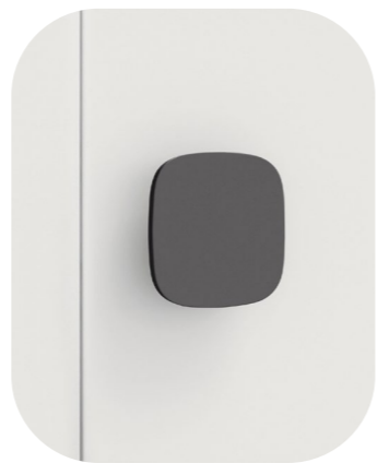
Brick 7 colori / colours