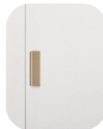
Pinna – Pinna XL 22 colori / colours