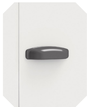
Shell 19 colori / colours