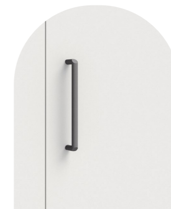
Bridge – Bridge L 7 colori / colours