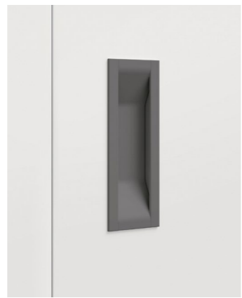
Lory - Lory L 2 colori / colours