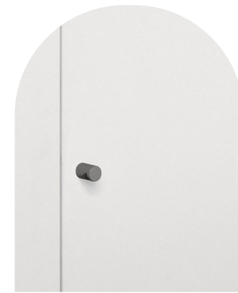
Out 21 colori / colours