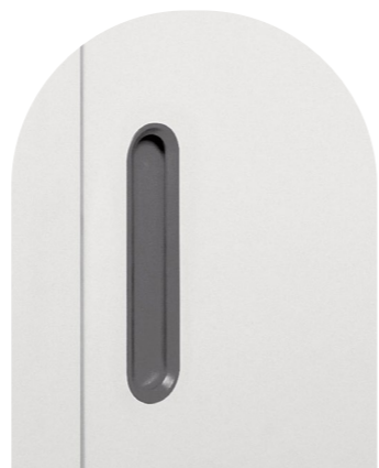
Ol 19 colori / colours